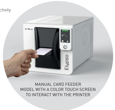
MANUAL CARD FEEDER MODEL WITH A COLOR TOUCH SCREEN TO INTERACT WITH THE PRINTER